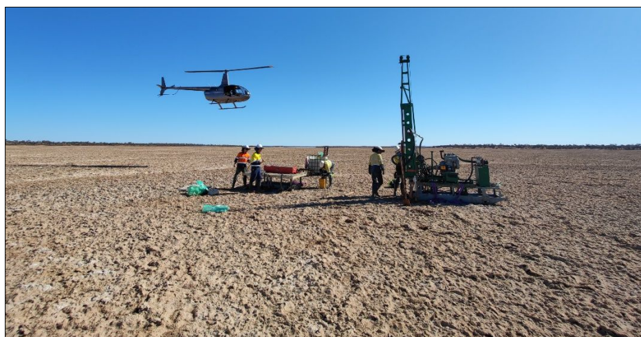
Figure 1: Heli-supported rotary drilling program in progress at Lake Throssell.

The in-fill gravity survey (Figure 2), comprising 14 lines for 107km, together with the survey conducted earlier in the year, will provide the first comprehensive and accurate picture of the entire tenement, helping the Company's exploration team to refine drilling locations for the air-core drilling program scheduled to during the Quarter.