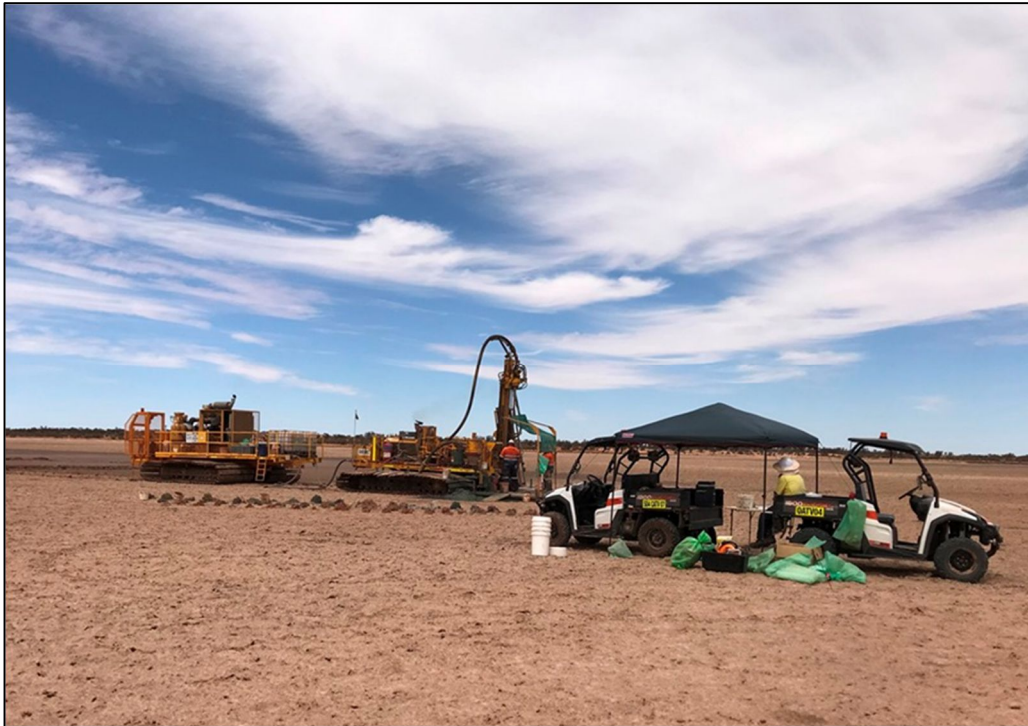
Figure 1: Air-core drilling at the Lake Throssell Sulphate of Potash Project